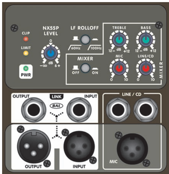
NX55P Rear Panel