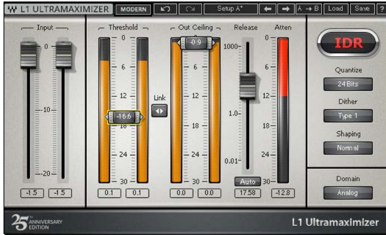
L1+ Legacy interface

Both interfaces offer the same sound quality and workflow.