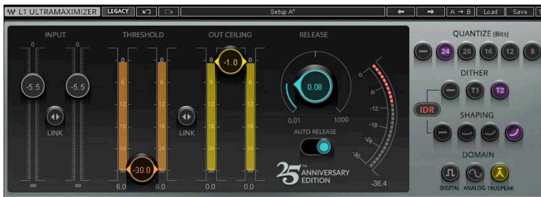
L1+UltraMaximizer Modern interface