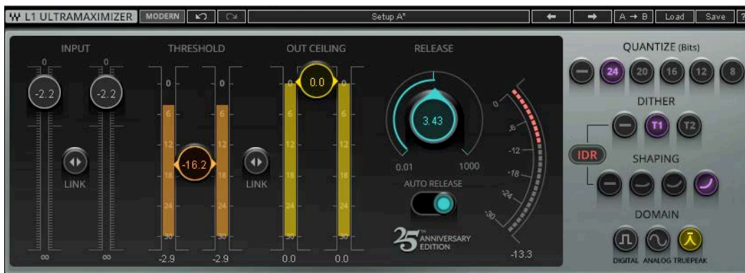
L1+UltraMaximer stereo component

L1+UltraMaximizer (stereo only): the "full" mastering plug-in with limiter and all IDR options.