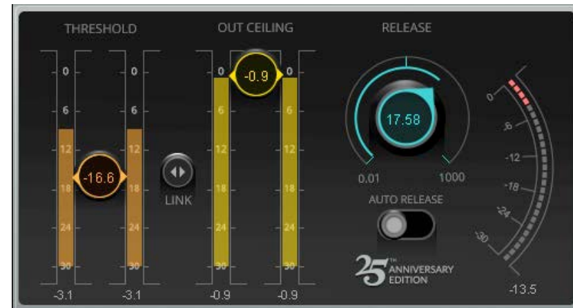
L1 Limiter stereo component