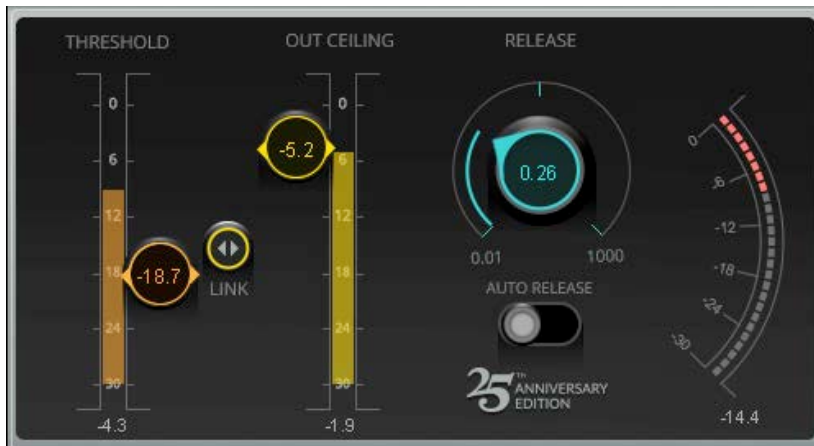
L1 Limiter mono component

L1 limiter: mono or stereo wideband limiter without IDR.