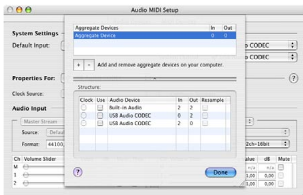
Fig. 2.1: Aggregate Device Editor