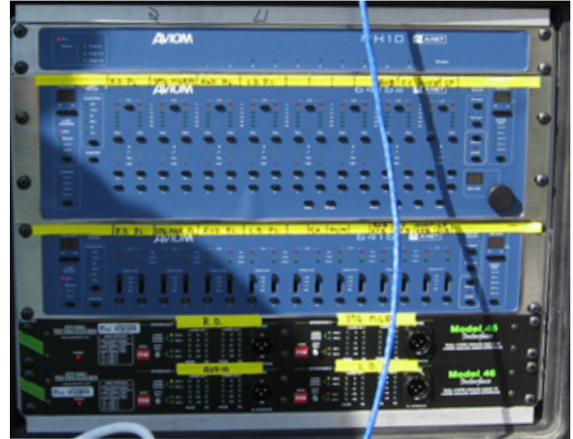
The remote location rack with Pro64 I/O and the Studio Technologies devices.

In the truck there is a second 6416o or 6416o v.2 Output Module receiving the remote mic signals, which are patched into the truck's audio mixing console. An RCI Remote Control Interface and MCS Mic Control Surface allow the engineers in the truck to control gain settings on the 6416m mic preamps at the remote location.