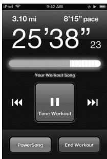
iPhone3GS or later, and iPod touch

Nike + iPod gives you spoken feedback on your progress during your workout (see “Getting Spoken Feedback” on page 15). You can also get feedback whenever you want it.