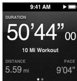
iPod nano (6th generation)